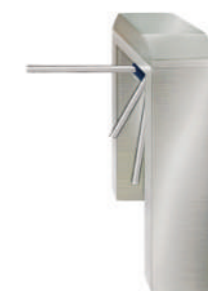
TRI Tripod Turnstile