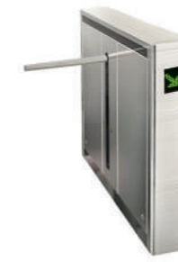
SPEED Drop Arm Barrier