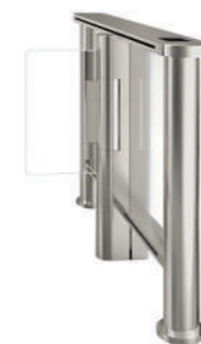
SWING Swing Barrier