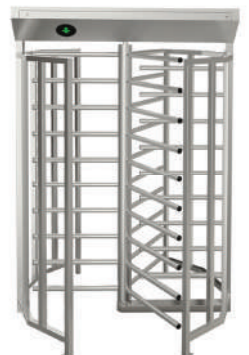
MAX Full Height Turnstile

More customising options available, call us at +65 6755 3306 or log on to www.zoomtech.com.sg to find out more.